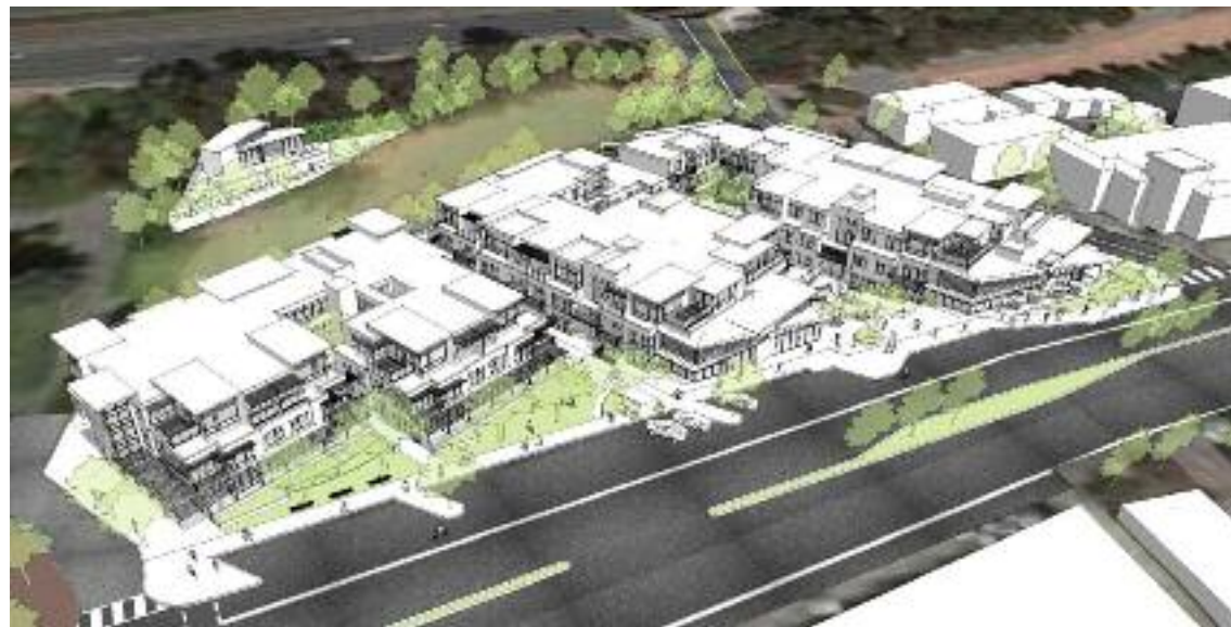
Proposed Lennar project

The new three-story development will also feature a restaurant anchoring the Dolores Drive corner, some commercial space, underground parking, a lap pool and pool house, two lobbies, a fitness room, bike storage and public art. Conditions of approval imposed by the city also necessitate improving the East Bay Municipal Utility District right-of-way with bicycle and pedestrian path upgrades and enhanced landscaping; the utility has an easement for an underground pipeline that diagonally bisects the property, which cannot be built upon, leaving a small triangle near the freeway that will house the pool and pool house.